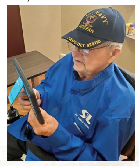
With the two tablets purchased with Roughrider Electric's grant, the facility has between 10 to 15 tablets total that are used every day, all day. Staff clean them between every use with a special cloth, and charge them every night.

"If you have family members or friends here as residents, know that the staff is taking care of them and attempting to step in when families aren't able to be here. Just because your loved one is in here, they are still getting great care, and the staff has come to take them on as family," she says.