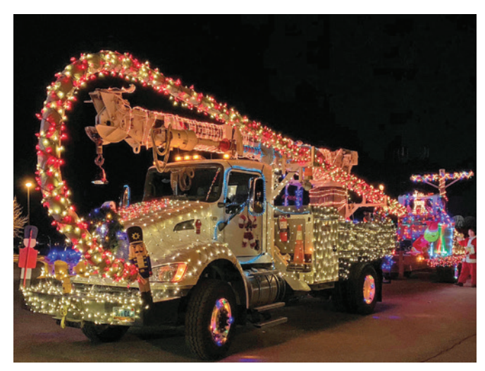
Some linemen decorated a float for the annual Parade of Lights in Dickinson. Santa even made an appearance, wearing hooks and waving from a pole.