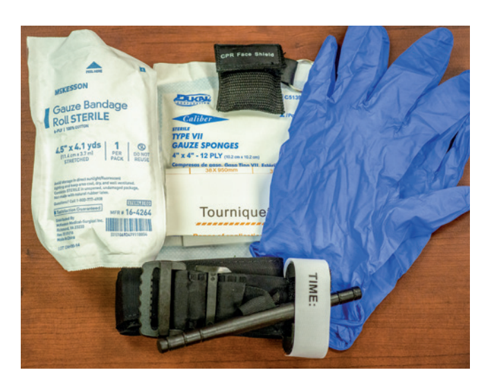
Last year, Roughrider Electric awarded $1,800 to Sakakawea Medical Center in Hazen to purchase tourniquets for its "Stop the Bleed" program. The money was conferred as a grant through Operation Round Up. Roughrider staff also received training in how to apply the tourniquets in the event of an emergency.