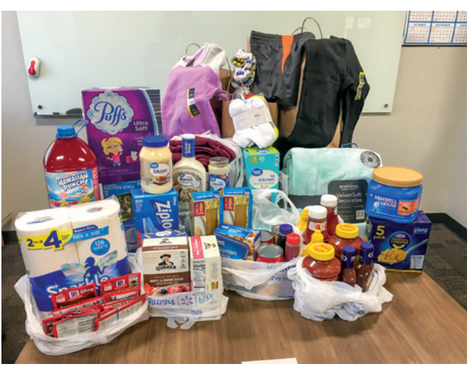
In December, Roughrider staff collected donations for the Domestic Violence and Rape Crisis Center in Dickinson.