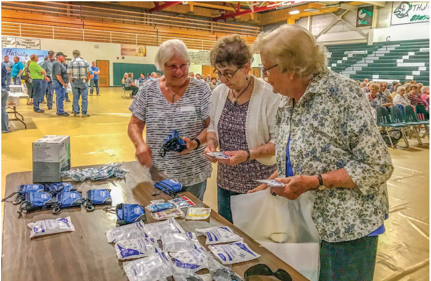
Safety is the culture of Roughrider Electric. At this year's annual meeting, members received a packet that contained ear