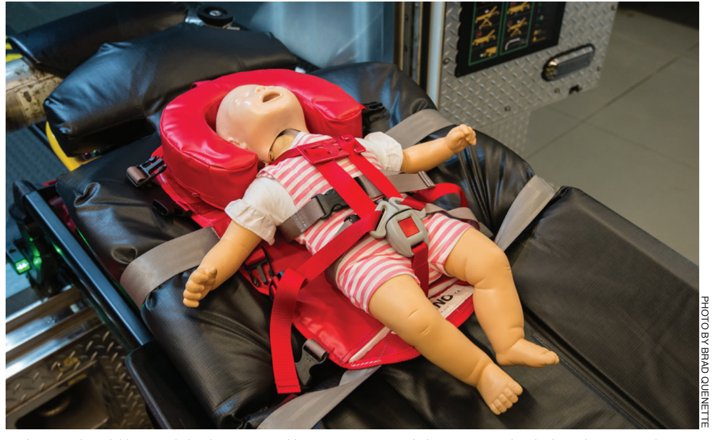
In the past when children needed to be transported by Mercer County Ambulance Service, they had to ride in a typical, bulky car seat that was difficult to move and store. Thanks to an Operation Round Up grant provided by Roughrider Electric Cooperative, the service was able to purchase a streamlined child-restraint system that "packs up nicely."