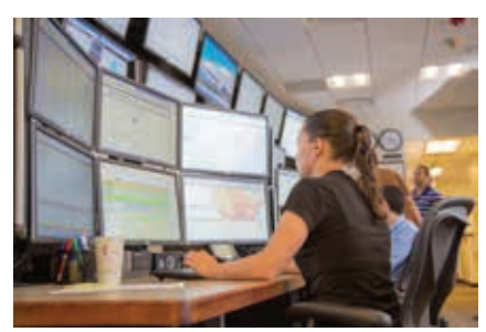
Basin Electric marketing room

Cooperative will continue to provide safe, reliable and affordable electric service. We have — and will continue — to work hard to accomplish that goal.