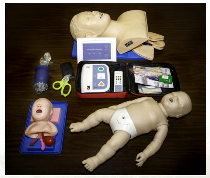
A sampling of equipment the Riverdale-Pick City Ambulance Service purchased with its Operation Round Up grant.

"It is very rewarding, though. It's hard, but it's rewarding," she said. "Just being able to help your community is always a nice feeling." ■