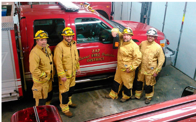
The Zap Rural Fire Protection District was awarded Operation Round Up funds for safety gear.