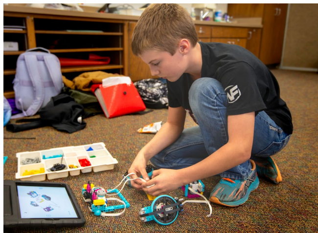
Hazen Lego League a 2023 Operation Round Up recipient.

For more information visit www.roughriderelectric.com or scan the QR code. If you have any questions call our office at 800-748-5533.