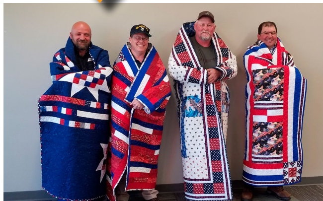
The local Quilts of Valor Foundation received grant funds in 2020.