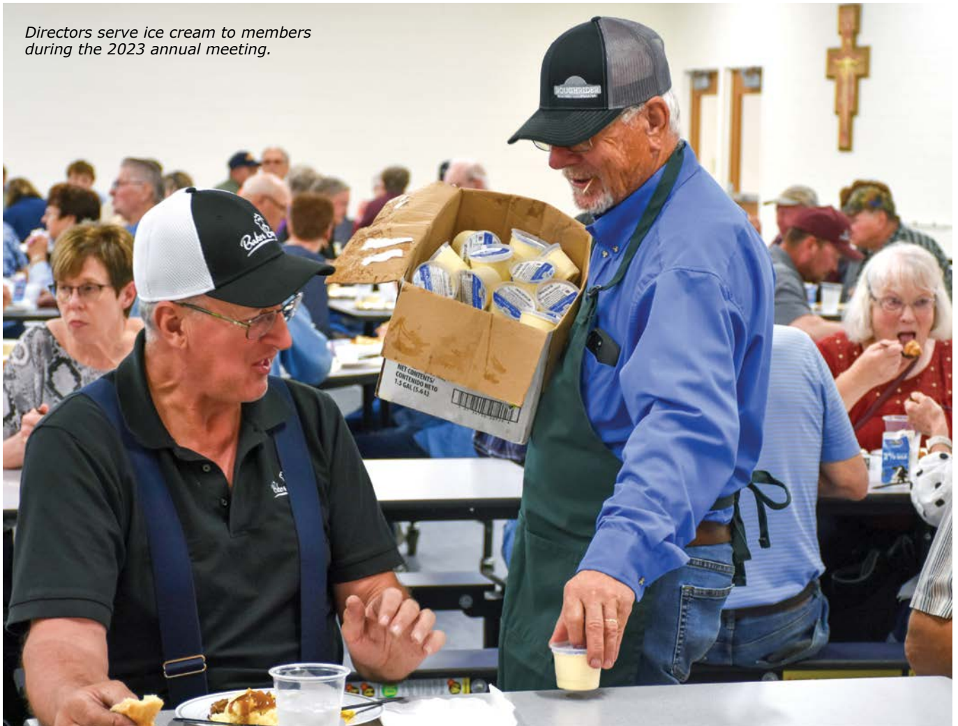
Directors serve ice cream to members during the 2023 annual meeting.